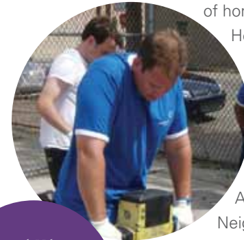
Genworth Volunteers revitalize a neighborhood by updating its central meeting place – Pop's Playground.

In Richmond, Virginia, four Genworth employees spent more than 300 volunteer hours assisting FRIENDS Association for Children, whose mission is to help children and families achieve their potential. The volunteers helped FRIENDS streamline their accounting process, improving time and cost efficiencies, which included saving them an estimated $65,000 in costs. The result, FRIENDS has a simplified child care administration system allowing quick access to parent and child records to better meet the needs of families and the organization.