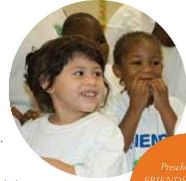
Preschoolers at FRIENDS Association for Children benefit from the work of Genworth Volunteers.

We know that education is essential to helping children live a successful life. That's why Genworth is committed to helping youth prepare for their futures. Through partnerships with schools and leading youth-serving organizations, we invest in programs that provide children with positive and strong role models to help them develop the social, emotional, and cognitive skills they need.